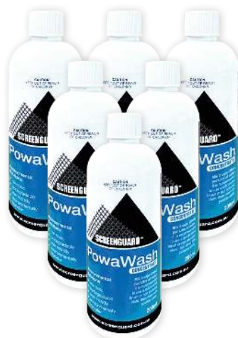
200ml per bottle